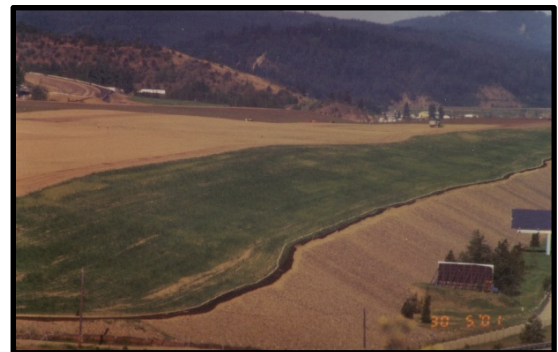
Bunker Hill (Superfund Site)

The high quality organic substances in Biosol consist of chitin and proteins that are natural polymers. Chitin increases a plant's resistance to disease and suppresses the ability of soil-borne pathogens to affect plant life and soil health. The organic substances in Biosol are stable, long term nutrient sources that build soil humus seven times faster than natural succession. The result of using Biosol is a healthy stand of native grass and plants, healthy soil life, long term plant health and nutrient cycling.